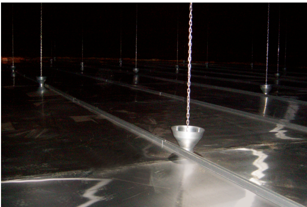
Figure 5. Suspended aluminium floating roofs introduce numerous safety benefits and increase usable capacity over leg-supported roofs.

of carbon steel, when evaluating the total lifecycle cost, it is important to factor in the need to coat and recoat the roof on a periodic basis – an expense that can be significant.