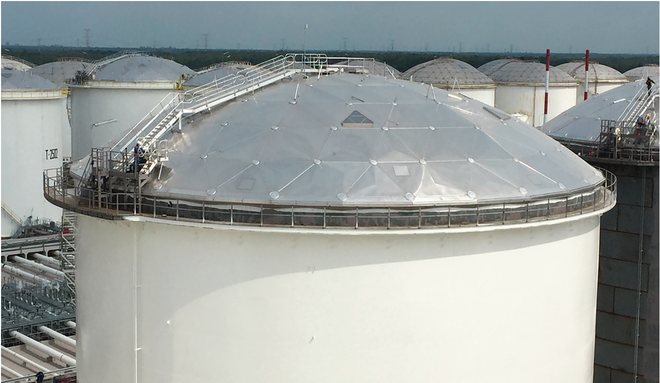
Figure 4. Installation of an aluminium geodesic dome on an open top tank can increase options with respect to IFR selection.