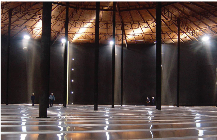
Figure 2. Aluminium internal floating roofs (IFRs) provide a durable, cost effective alternative to traditional carbon steel IFRs.