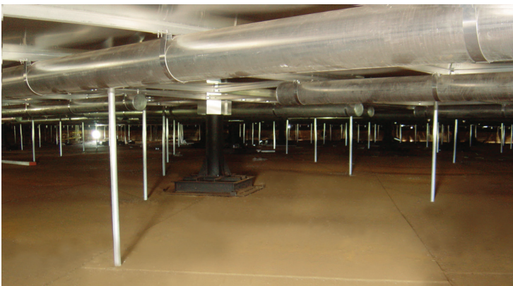
Figure 3. Skin and pontoon designs for floating roofs are the most prevalent in the industry and can be designed to support 1000 point loads.