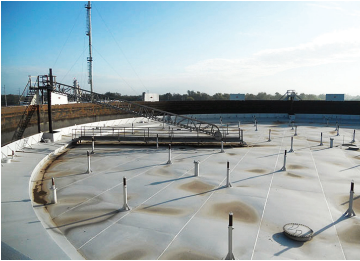
Figure 1. Carbon steel, which is the most prevalent and durable choice for floating roofs, also carries the highest initial capital cost and comes with other potentially significant lifecycle costs. It can also present safe entry issues.